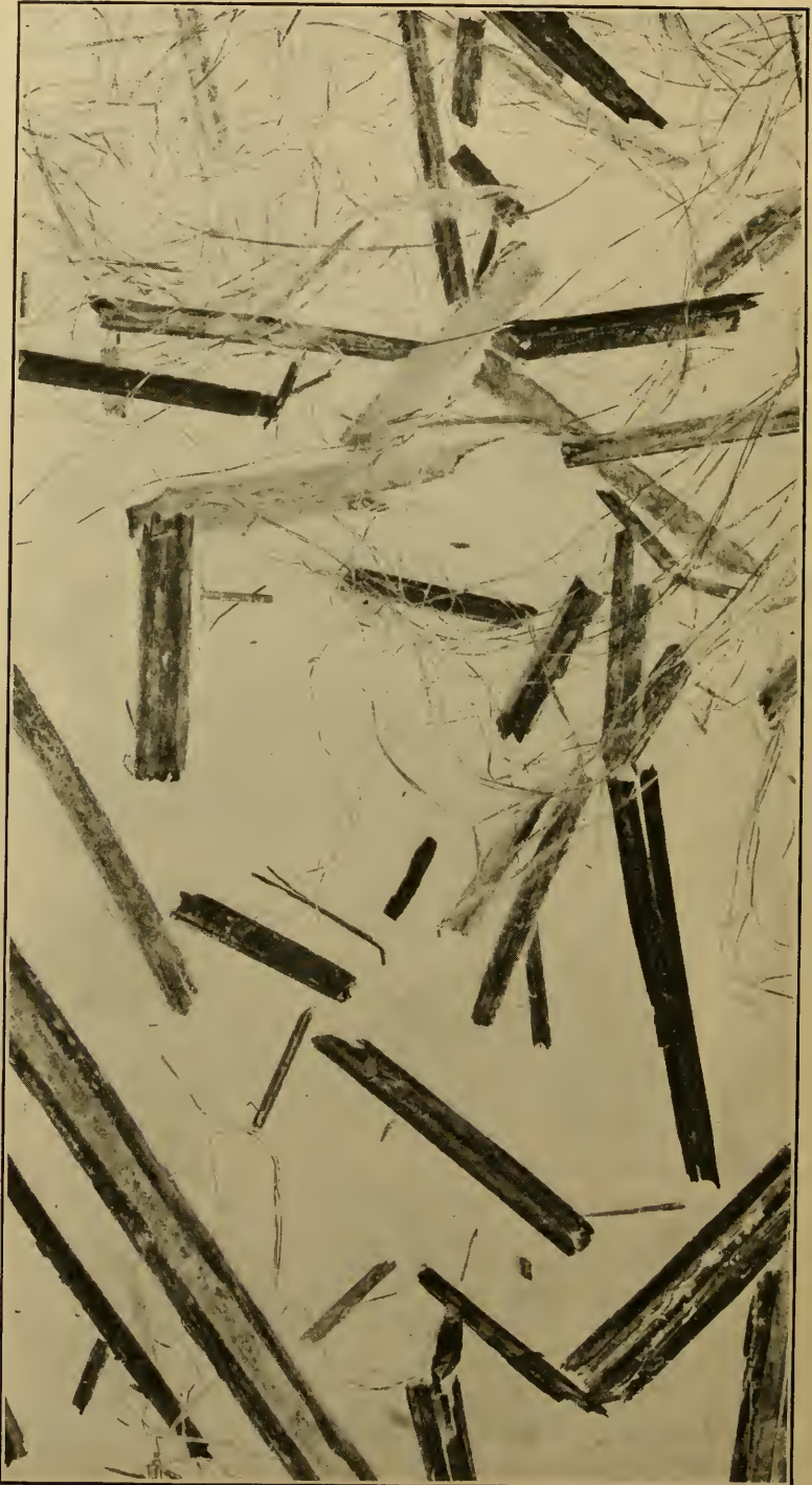
FIG. 3.—A representative sample of hemp hurds, natural size, showing hemp fiber and pieces of wood tissue.